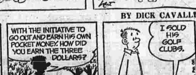
MORTY MEEKLE BY DICK CAVALLE