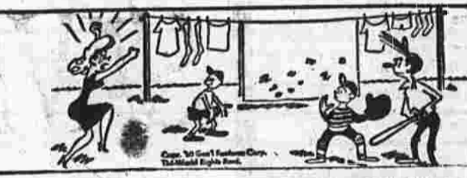
LITTLE SPORTS BY ROUSON