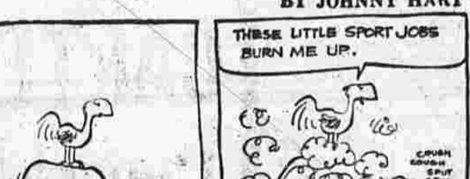
B. C. BY JOHNNY HART